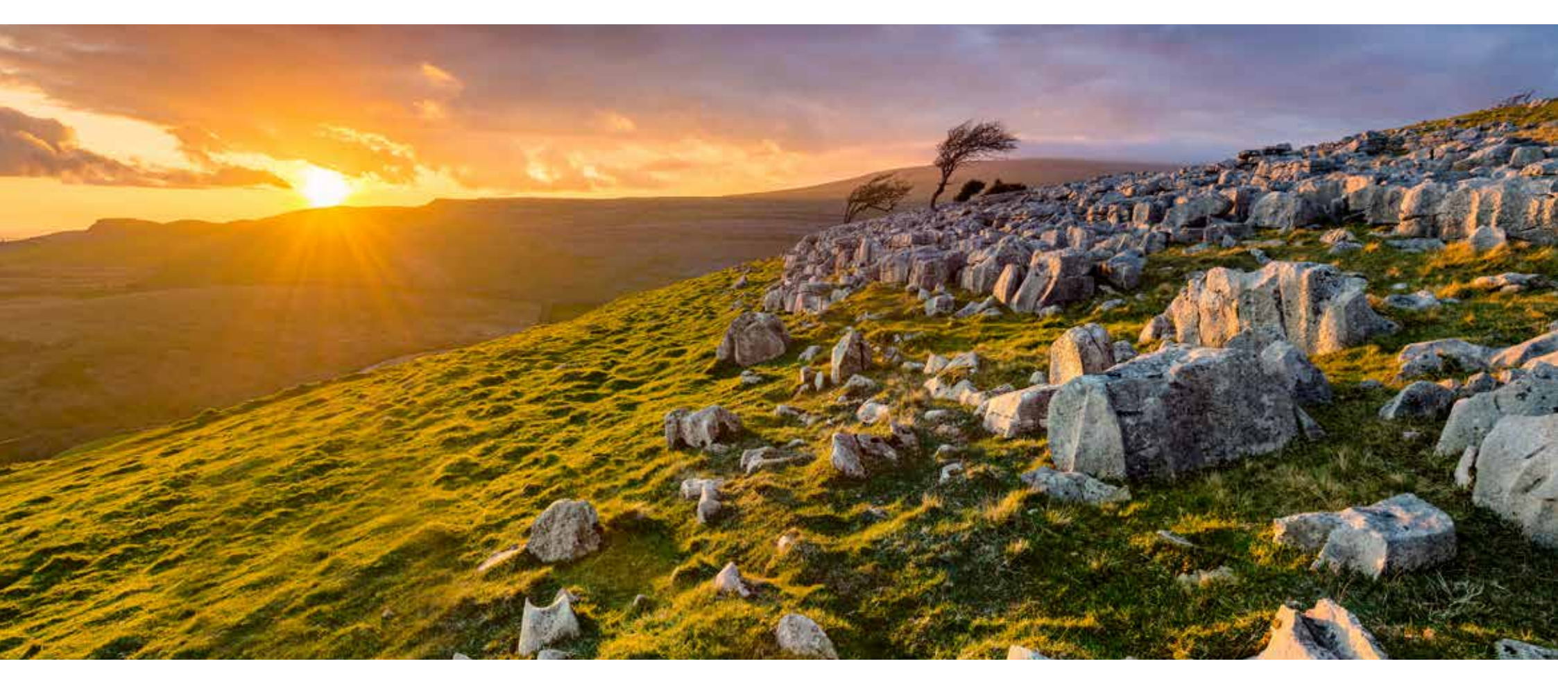
Holiday Home Ownership in the Heart of Yorkshire